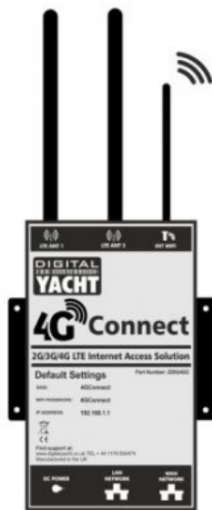
4GConnect Standard System